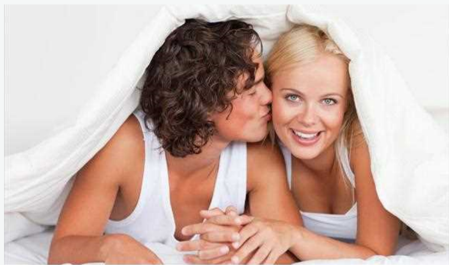
Pheromones Attracting Women Secret Weapon