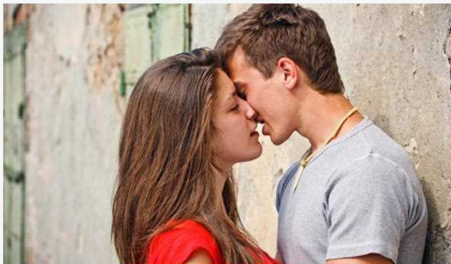
PheromonesBuy PheromonesHuman PheromonesPheromone ProductsPheromones

Your understanding of exactly what pheromones is going to do for you. This is very important because you need to understand - by simply buying pheromones and then splashing them on is not going to guarantee you'll grow to be a good attraction magnet.