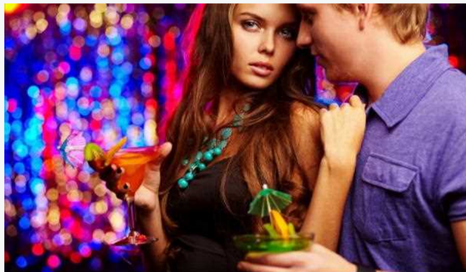
Pheromone ConcentratePheromonesPheromones ColognePheromone

With a cologne's power to be picked up by a person's olfaction, it makes good sense that your pheromone concentrate be included with the fragrance for maximum effect.