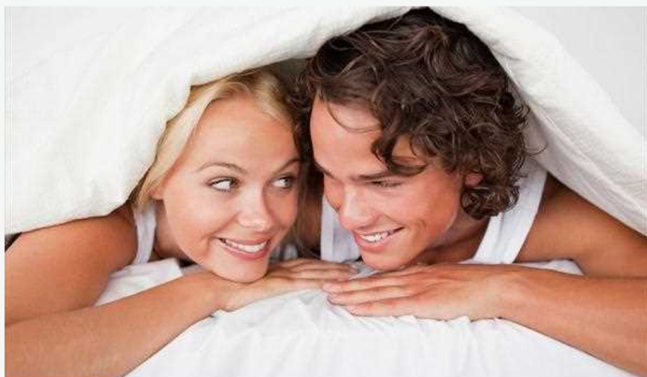
PheromonesPheromones CologneHuman Pheromones

One experiment performed at the University of Kentucky showed that women exposed to pheromone-sprayed photographs of men found them to be more attractive than those which weren't. Pheromones are well documented in the animal kingdom as the force that controls all social actions, especially mating. Some Perfume consists of these pheromones in a wonderful smelling spray. Scientists believe that pheromones cologne and perfume also work in human beings to increase attraction.