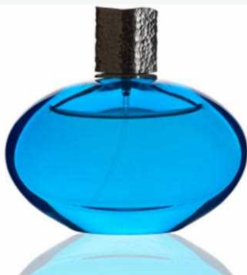
Pheromones Pheromones Perfume Human Pheromones