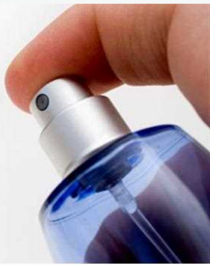
Pheromones Favorite Perfume Buy Pheromones

Looking or hard to find as well as rare scents is now possible at Perfume Pleasures www.sew-beautiful.us/perfumepleasures