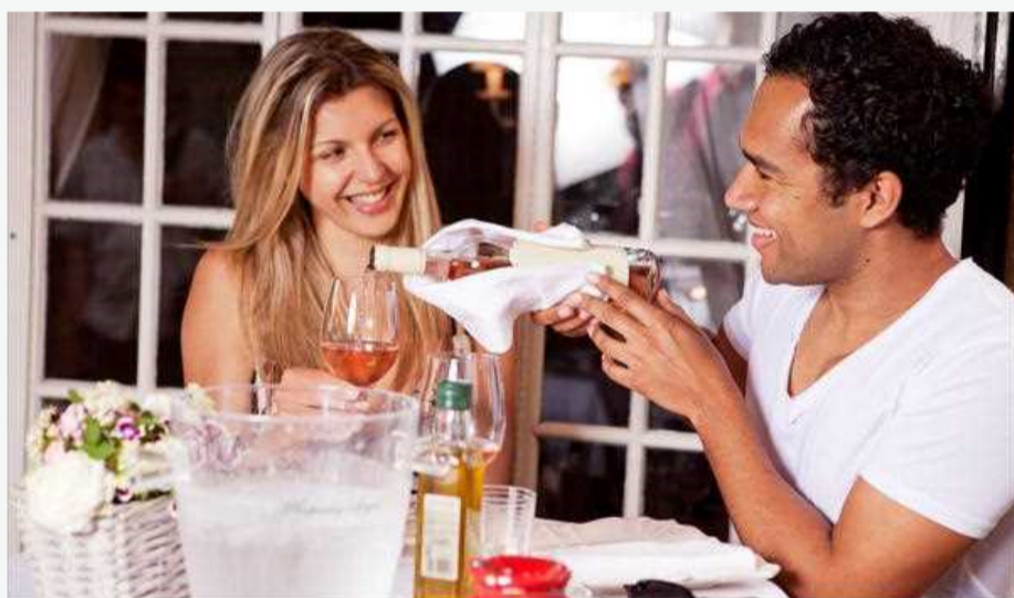
Pheromone Cologne Pheromones Pheromone Colognes Pheromone