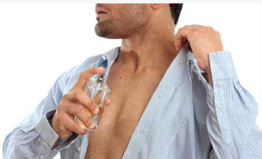
PheromonesSexual AttractionAttract WomenPheromone ProductSeductionAndrostenoneSex