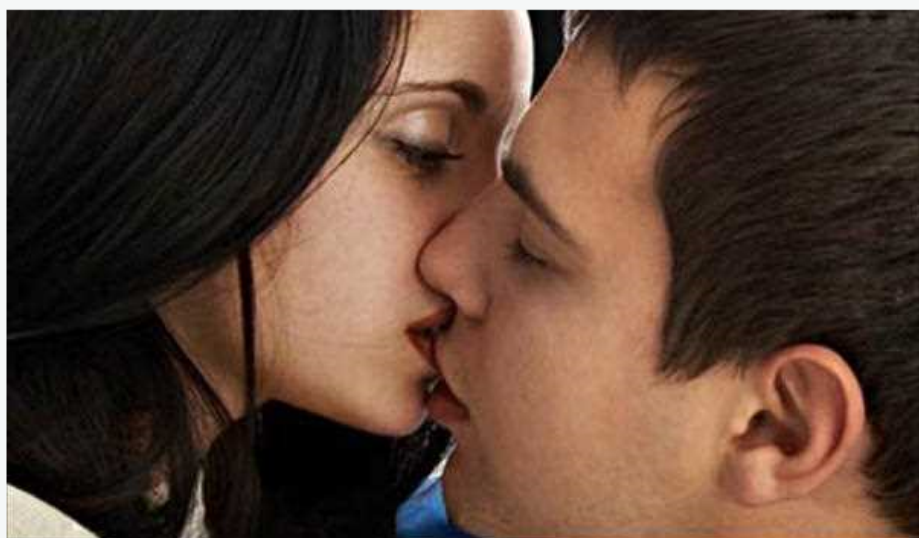
PheromonesMale PheromonesFemale PheromonesSecret WeaponMale