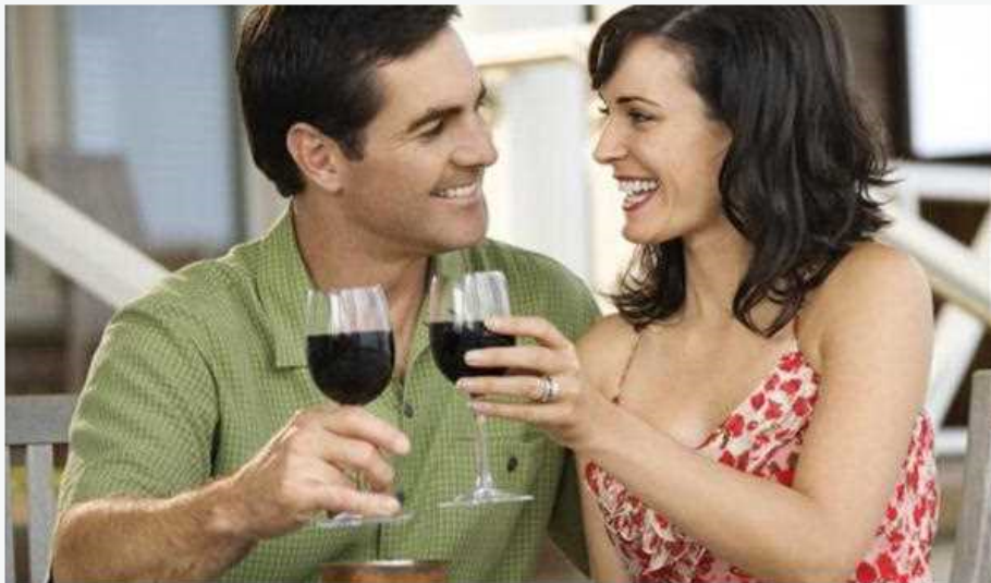
Pheromones Pheromone Cologne Pheromone Perfume Pheromones

Is not an easy task to develop a relationship, if individuals are not familiar with each other. The pheromone perfumes provoke intense feeling to go in in the sexual intimacy feelings. Not taking off from the fact that bodily attractiveness, organic beauty do well to attract opposite sex, but not everyone is blessed with good looks and great body, therefore people try out pheromone perfume. It also helps in relaxing the mind as well as boosting ones selfconfidence. Mostly this pheromone perfumes can be used to keep up stability between married couple, who almost find it difficult to carry on successfully with their sexual life. The success of these kinds of scents is not unfamiliar actually among the children who always work out to try new and unique things.