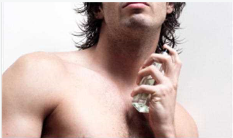
PheromonesChemical CompoundsDating Scene