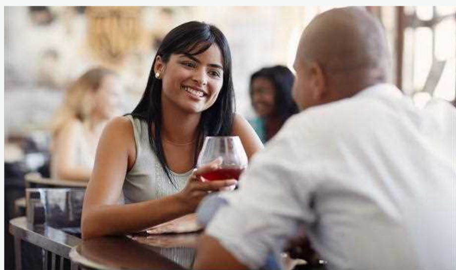
Pheromone Scent Attract Women Pheromones Natural Pheromones Unfair