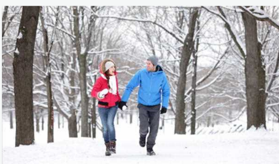
The Gilroy Perfume

Learn how pheromones can help you in looking after your relationship and pheromones for men can keep it strong, visit luvessentials.com